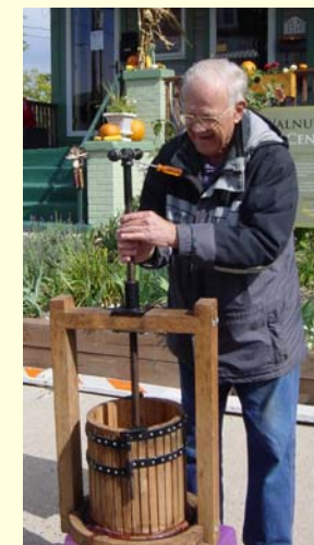
Pressing Concord Grapes donated by friendly farmers

and attendance. While similar to many famous street festivals in Milwaukee, the diversity attracted by Harvest Day is second to none. Folks from all walks of life join to celebrate a community who refused to accept the status quo. Events which engage residents, supporters, and agencies serving the Milwaukee Community are key to weaving our social cloth. Harvest Day is a testament to the rebirth of this neighborhood and proof that collective action creates results. We will celebrate the 10th anniversary of Harvest Day and the 100th anniversary of the Walnut Way Center in October 2010. We hope you can join us for this momentous occasion.